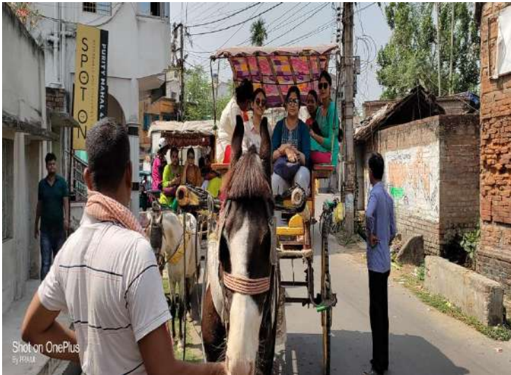
Horse Carriage Ride