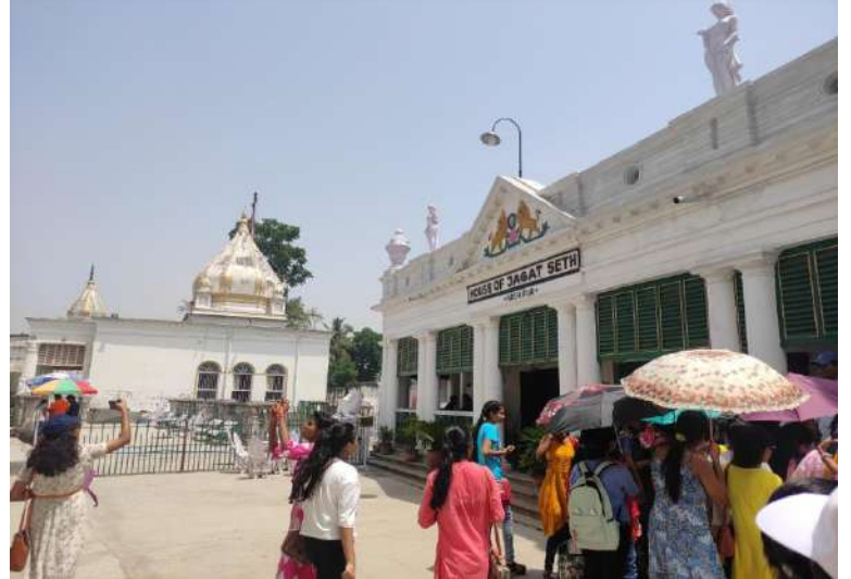
House Of Jagat Seth