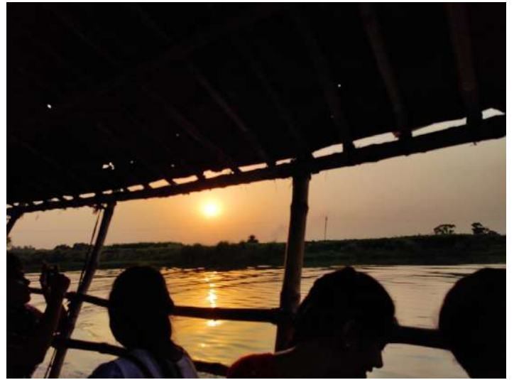
Journey by boat, River Bhagirathi