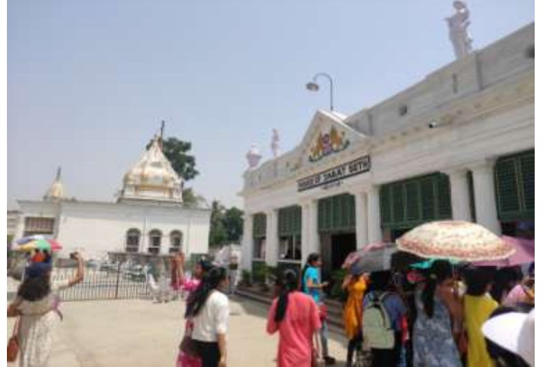
House Of Jagat Seth