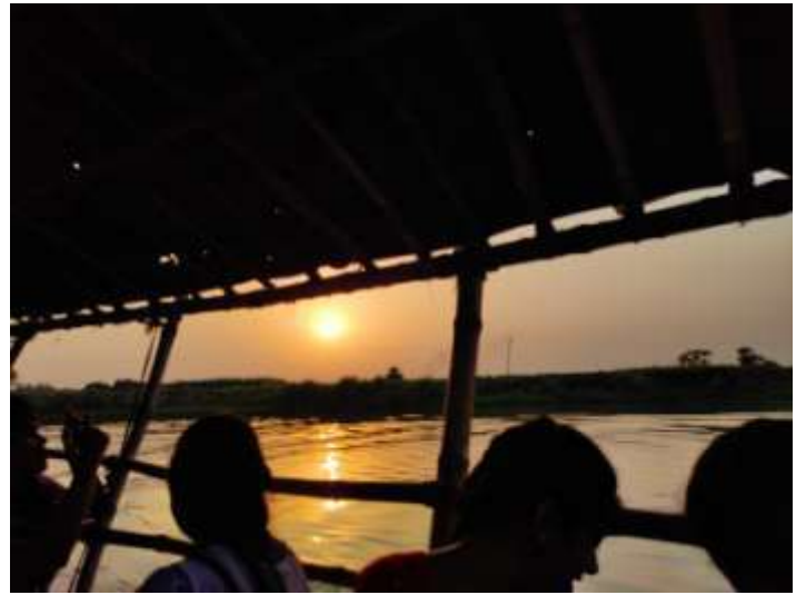
Journey by boat, River Bhagirathi