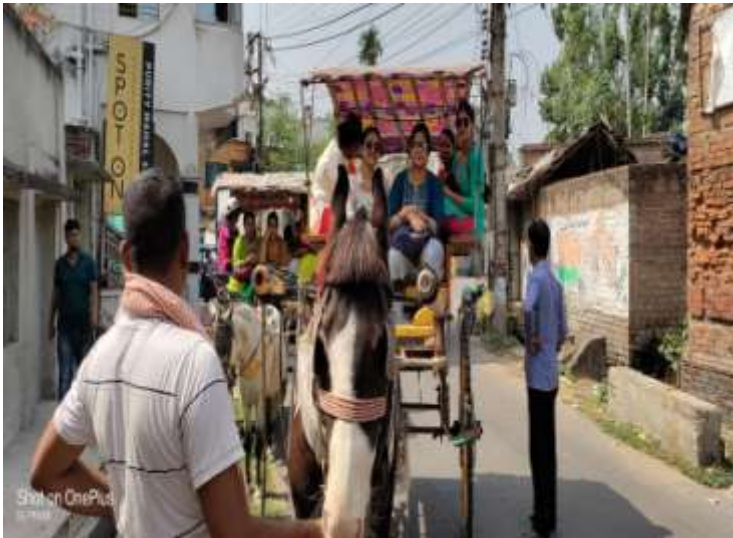
Horse Carriage Ride