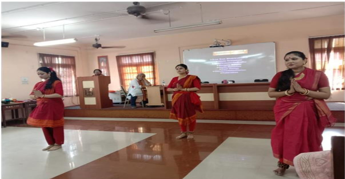
Steps of Gauriya Nritya